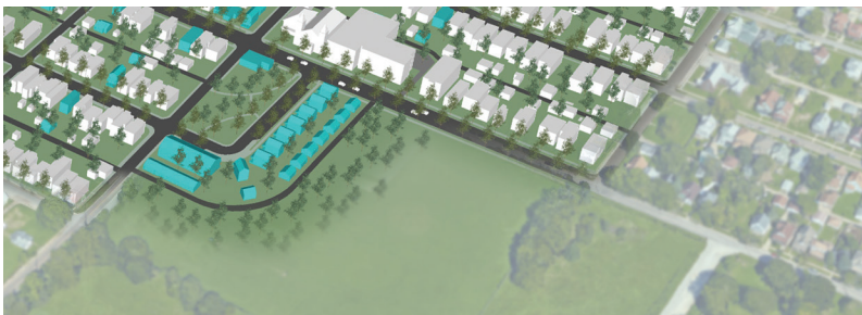
MAX BAHR PARK