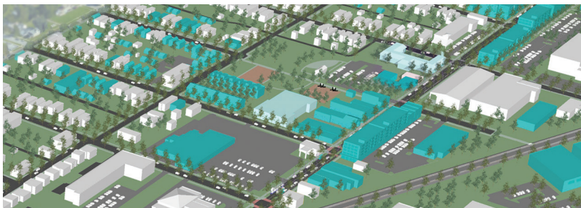
BELLEVIEW PLACE REDEVELOPMENT