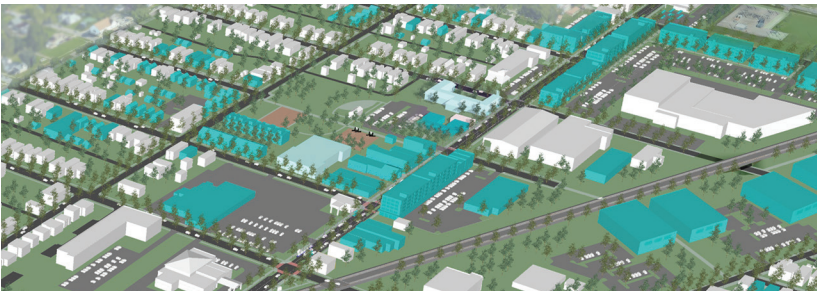
MICHIGAN STREET DEVELOPMENT